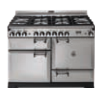
NEW STAINLESS STEEL